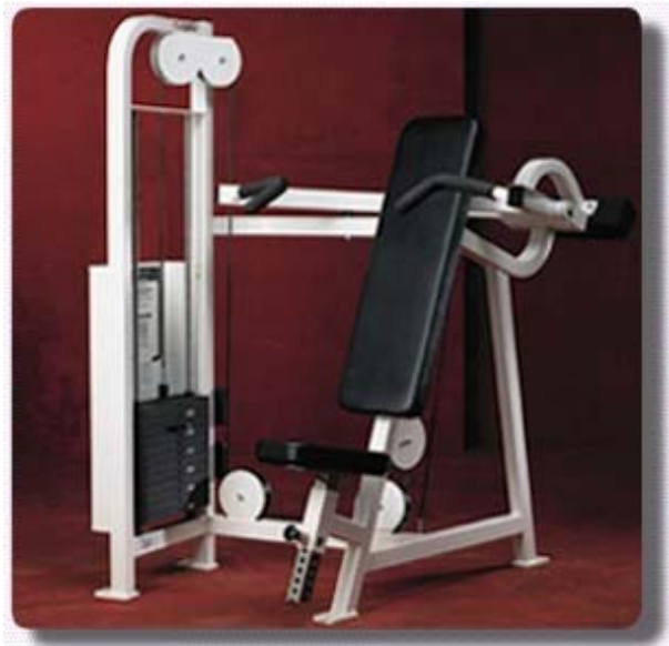
Cybex VR Classic Shoulder Press

Strength training equipment includes 10 pieces of Cybex Classic VR selectorized weight equipment. Cybex is a world leader in the strength training industry.