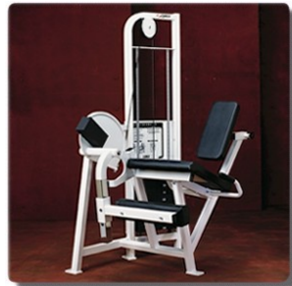
Cybex Classic VR Leg Extension

The fitness center will include 7 pieces of cardiovascular equipment to help burn calories, lose weight, and improve heart and general health. The center includes 2 treadmills, 2 climbers, 2 bikes and 1 cross trainer. Each piece is built by industry leaders such as Tectrix, LifeFitness and Star Trac.